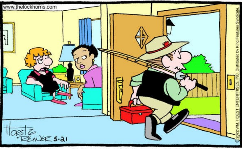
"TEACH A MAN TO FISH AND HE'LL THINK HE'S SELF-TAUGHT."